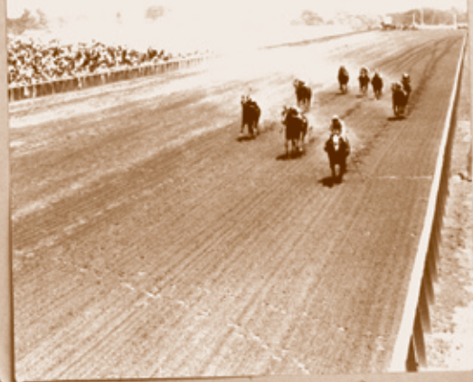
Inaugural Race F. L. R. A. - May 23